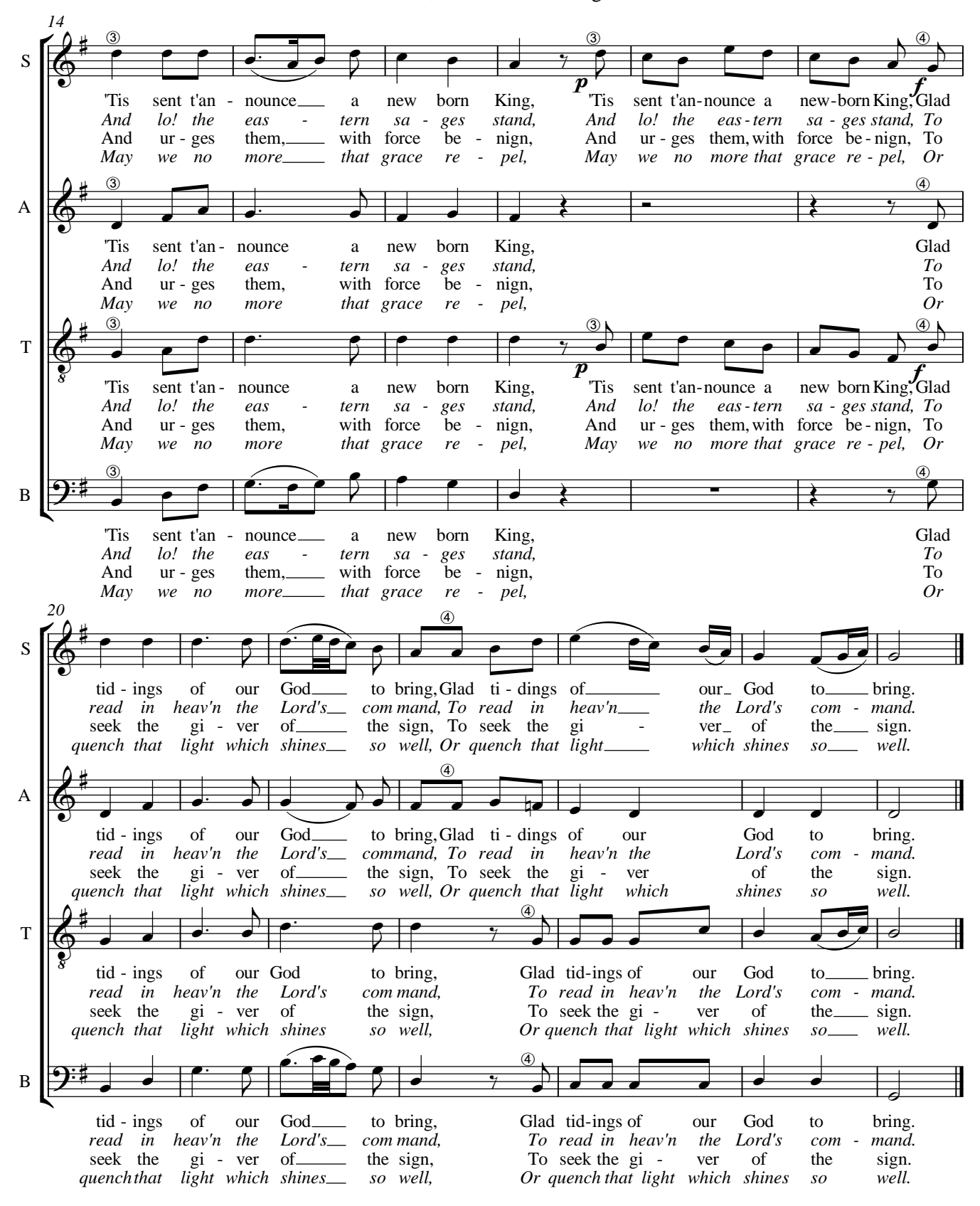
What star is this, with beams so bright? 291

5. To God the Father, God the Son, And Holy Spirit, Three in One, May ev'ry tongue and nation raise An endless song of thankful praise!